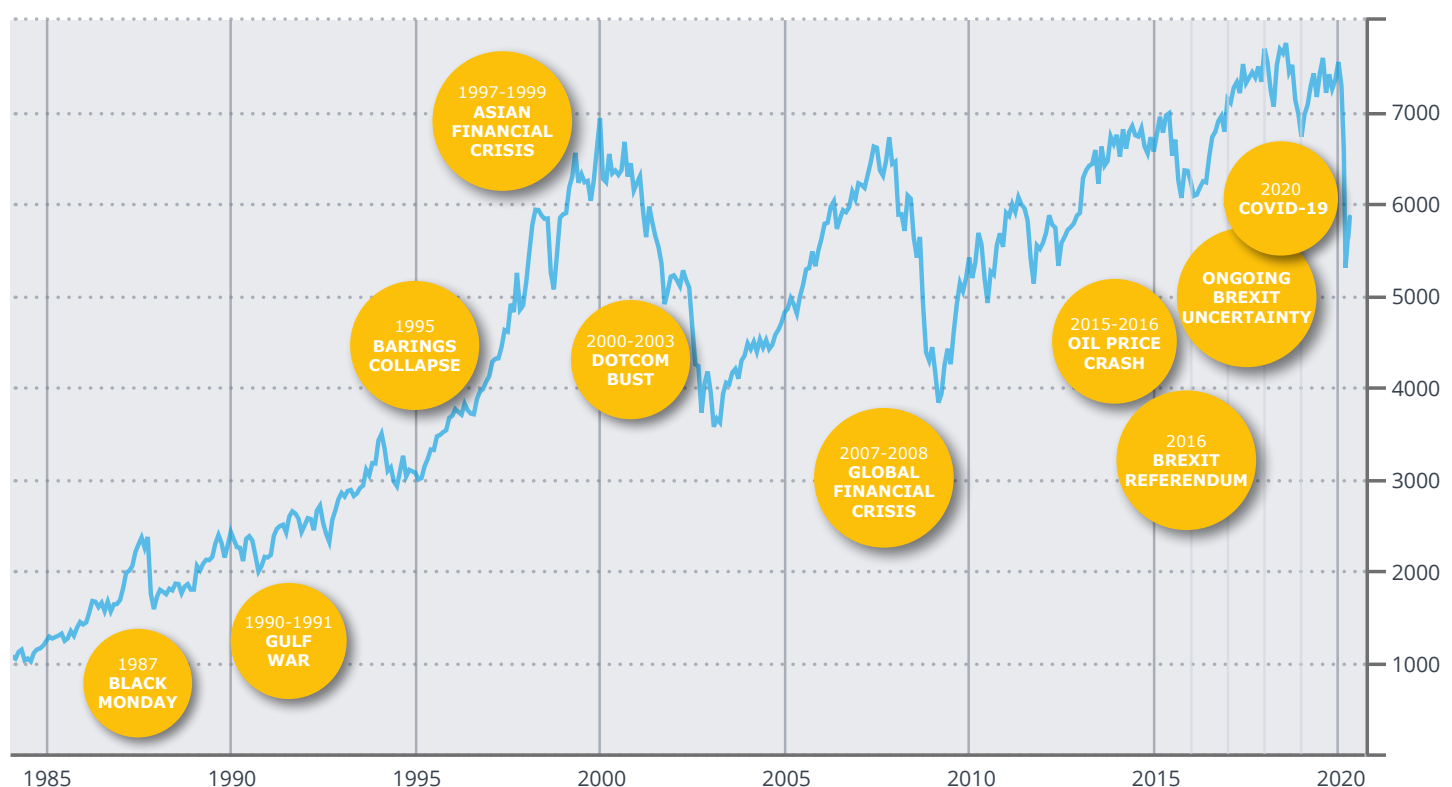
Chart: FTSE 100 since inception to April 5 2020, source Yahoo and Trading Economics

The value of investments can go down as well as up and you may not get back the full amount you invested. The past is not a guide to future performance and past performance may not necessarily be repeated.